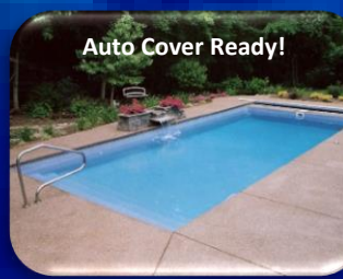
Sunburst – 16' x 33'