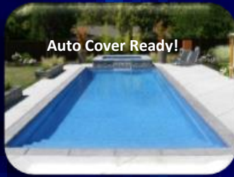
Portia – 16' x 40'