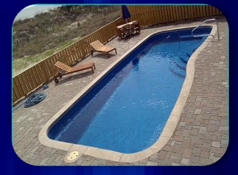
Pacific 2.5 – 14' x 33'9"