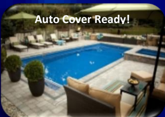
Whitsunday 2 – 15'8" x 35'