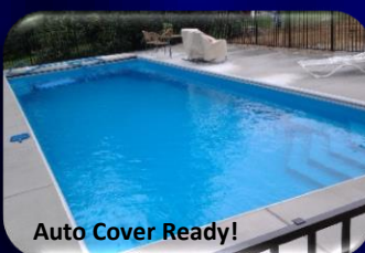
Whitsunday 1 – 15'8" x 40'