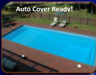
Athens – 16' x 40'

The Rectangle Shape offers clean lines, timeless design and the most volume and space to for you, your family and guests to play. There are many stair and bench configurations from which to choose. Many of these models offer Automatic Pool Cover ready feature meaning the pool can readily receive the auto cover system (tracks and housing unit), install very cleanly and provide the most opportunity for the system to be 'hidden'.