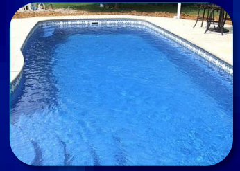
Pacific 1 – 14' x 39'