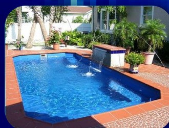
Grande 4 – 11'8" x 23'