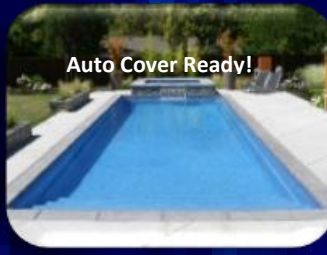
Portia – 16' x 40'