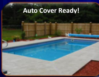
Asbury – 12' x 25'