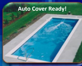
Venus – 14' x 33'