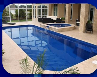
Grande 2 – 13'9" x 29'