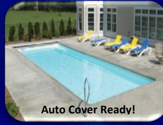
Olympic Bay – 16' x 41'