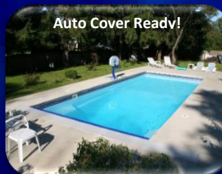
Trident – 14' x 31'6"