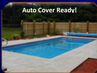
Asbury – 12' x 25'