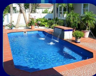
Grande 4 – 11'8" x 23'