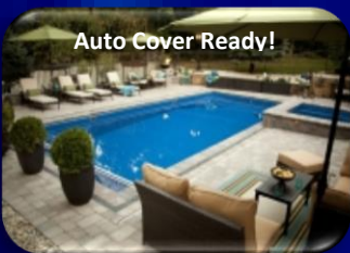
Whitsunday 2 – 15'8" x 35'