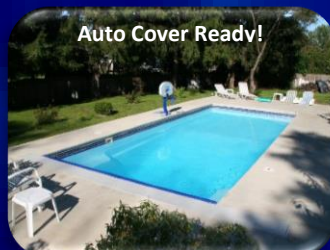
Trident – 14' x 31'6"