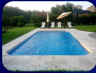
Grande 1 – 13'9" x 35"