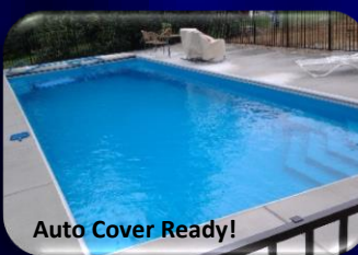
Whitsunday 1 – 15'8" x 40'