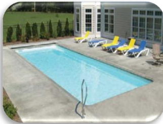
Olympic Bay – 16'x41'