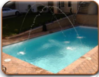
Apollo – 16'x38'