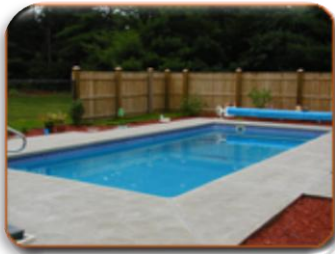
Asbury - 12'x25'