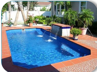
Grande 4 – 11'8"x23'