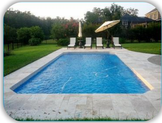
Grande 1 – 13'9"x35'