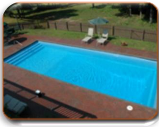
Athens – 16'x40'