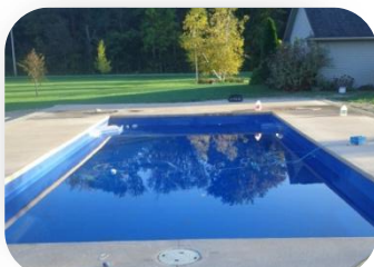
Whitsunday 2 - 15'8"x35'