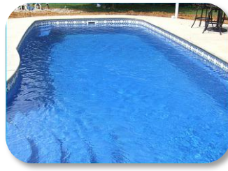
Pacific 1 – 14'x39'