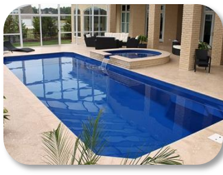
Grande 2 – 13'9"x29'